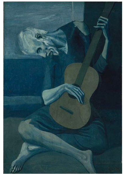
Picasso’s Blue Period

Throughout all of Picasso’s career, through all his different styles, he was also an illustrator. He would produce drawings, sometimes for books, that used fast-drawn lines that were then brushed with ink. These illustrations were very simple, and often only used very few lines, but a person could always tell just what Picasso wanted to show. In all of his many styles, he was always trying to find a way to show the world how he saw things in his imagination.