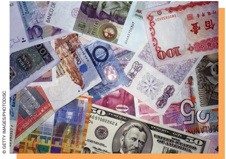
International currency is exchanged at a foreign exchange market.

foreign currency . If a U.S. business wants to purchase goods from a member of the European Union it will need to convert U.S. dollars to euros. In the same way, if a Japanese automobile manufacturer ships pickup trucks to Mexico, pesos will need to be converted to yen. To make the conversion from one currency to another, an exchange rate must be established. An exchange rate is the value of one currency in terms of another. Exchange rates in the U.S. are often expressed in terms of how much of a foreign currency is required to purchase one dollar. For example 1.23 CAD/USD means that it takes 1.23 Canadian Dollars to purchase one U.S. Dollar.