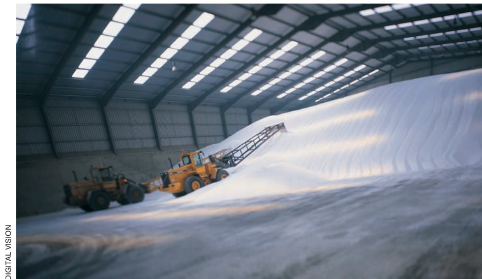
Sugar is traded at a specialized commodity exchange.

Two types of markets exist for the sale of commodities. Spot markets buy and sell products for immediate (on-the-spot) delivery. Futures markets are contracts negotiated for the sale of products at some future date. For example, an airline may negotiate a futures contract for a large amount of aviation fuel to be delivered in six months so they will have an adequate supply at a guaranteed price. A farmer may negotiate a futures contract to sell cattle at a specific price to be delivered in four months. By negotiating a certain future price for each of the commodities, the airline knows what its fuel costs will be and the farmer knows what price he will receive for the cattle when they are ready for market. Negotiated prices reduce some of the risk in the purchase and sale of commodities.