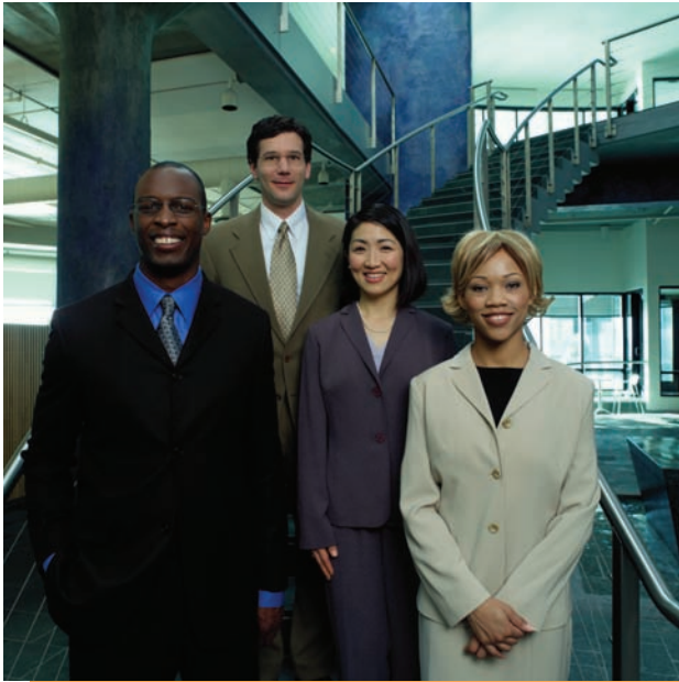
Business partners share the risks and rewards of ownership.