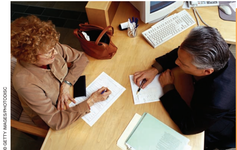
Personal contact between customer and creditor can help resolve late account problems.

If payment is not received shortly after the first letter is sent, the customer should be contacted by telephone. A well-trained member of the collections staff should remind the customer of the unpaid account, gather information on reasons that the account is unpaid, and discuss procedures for prompt payment. If the customer is not paying because of problems with the order or the product, those issues should be quickly resolved. If payment is delayed due to financial problems, alternatives for payment including a payment schedule should be agreed upon. If it appears that the customer is unwilling or unable to pay the overdue balance, restrictions on future orders should be placed on the customer's account.